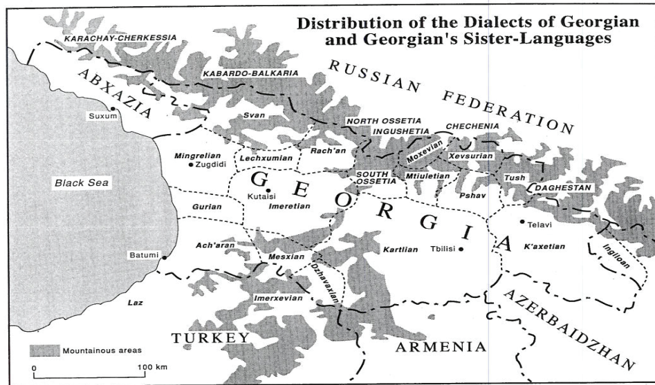
Figure 1. Distribution of Kartvelian dialects and languages.

Among other reasons, for the better part of a thousand years they have had more intimate regular contact with Nakh-Daghestanian languages, and have borrowed numerous words from them: balgi ‘child’ (cf. Lezgian bal’a ‘child’), bage ‘lip’ (cf. Ingush and Chechen baga , Batsbi bak all ‘mouth’), ali ‘flame’ (Ingush ala , Chechen alu , both ‘flame’), riq’e ‘stone’ (cf. Botlikh req’a ‘hill’). Independent of this, they have also developed a number of features not directly attributable to language contact, such as distinct lexical items ( kood ‘completely’ instead of Standard sruiliad , mtliad ), differential suppletion patterns ( mi-ol ‘I’m going’ vs. Standard m-v-di-var ‘id.’), semantic shifts (Khevsur xoq’ana ‘people’ < kveq’ana ‘land’; cf. standard xalxi ‘people’), a different number system ( xut-oci ‘five-twenty’ = ‘hundred’, vs. standard asi ).