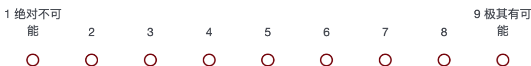
Figure 1. Experimental trial

4. Results. A series of mixed-effects linear regression models were constructed in R Studio to test the effects of context, verb, and verb form on likelihood ratings. Best-fit models were assessed through chi-square likelihood tests using the anova function. I first report all of the main results for the sake of transparency in this section. In the following section, I highlight and discuss the findings that are particularly interest for our goals.